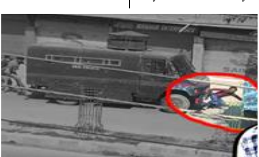
Screen shot from video footage

"We were at home when the news of my son reached me. It was shock of my life. I hid no words to say. When I heard and even see (on video) how brutally